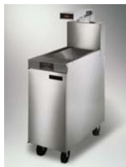
FDS-100 with optional heat lamp.