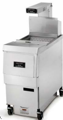
Fryer dump station model FDS-200 shown with optional overhead heat lamp.