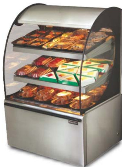
Space Saver hot express case, model HEC-123.