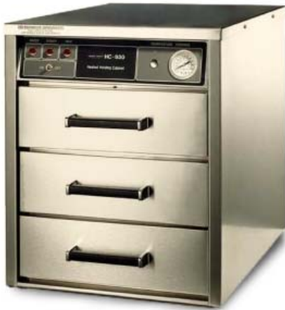
Heated Holding Cabinet, humidified countertop Model HCH-930 shown with electro-mechanical controls.

MODEL HCH-932 two-drawer HCH-930 three-drawer