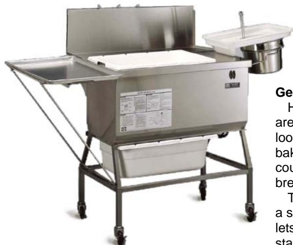
Model HB-121 hand breader/sifter configured for right to left work flow. (Sheet pan sold separately.)