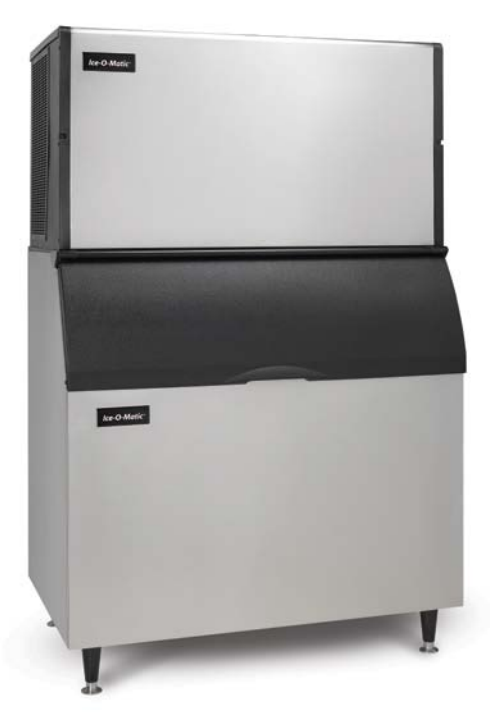
ICE2106 ON B100