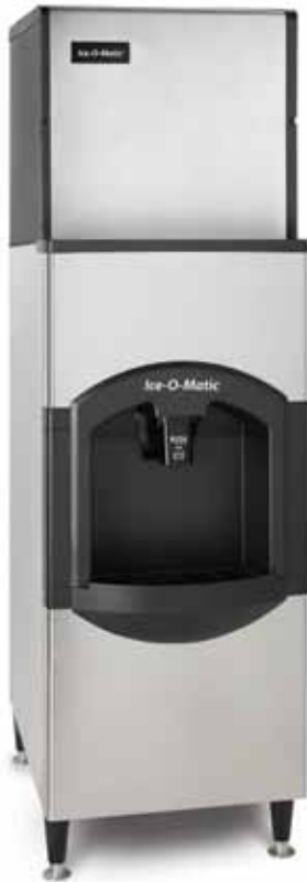
CD40022 WITH ICEO320