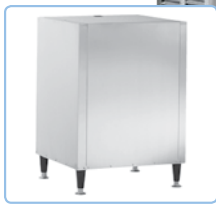
Optional Stand - GDS5