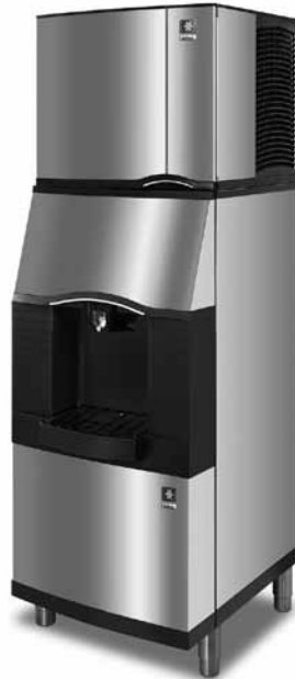
S-Series 422 Ice Machine SPA-160 Ice Dispenser

Ice only dispense, with coin-op and room card dispensing control options