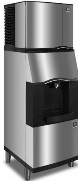
S-Series 422 Ice Machine SFA-191 Ice & Water Dispenser