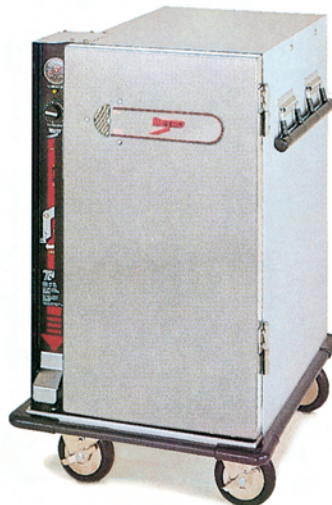
TC90S shown with bumper