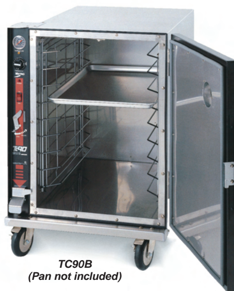
TC90B (Pan not included)