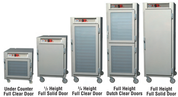
Under Counter Full Clear Door 1/2 Height Full Solid Door 3/4 Height Full Clear Door Full Height Dutch Clear Doors Full Height Full Solid Door

METRO C5 8 Series Controlled Temperature Holding Cabinet