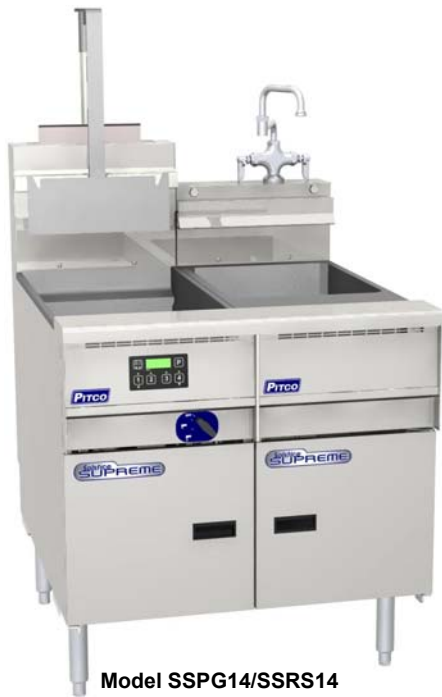
Model SSPG14/SSRS14 Shown with options: Manual Water Fill and Single Basket Lift