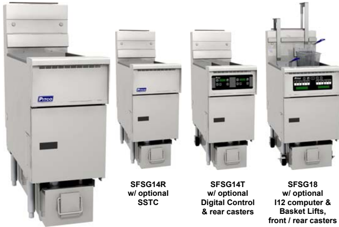
SFSG14 w/ standard Millivolt T-Stat

SOLOFILTER Solstice Gas (SFSG) Series SFSG14, 14R, 14T, 18 Fryer