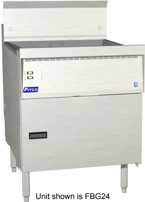
Unit shown is FBG24

Model FBG18 and FBG24 Flat Bottom Gas Fryers