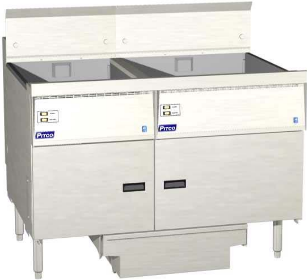
Unit shown is FBG18/FD/FBG24