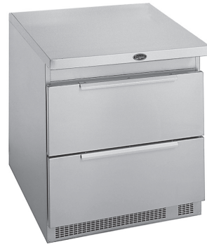
model 9404-32D-7 shown

REFRIGERATION: CFC free, R-134a (refrigerators), R-404a (freezer) back-mounted refrigeration system to be self-contained with evaporator blower coil, compressor, thermostatic control, forced-air condensing coil and capillary tube contained in removable assembly. Condensate evaporator provided. Units totally prewired and to be supplied with 8' cordset (NEMA 5-15P) for 115V operation. "Front Breathing" refrigeration system, requires no side or back clearance. Integrated rubber bumpers provide 1" rear clearance on model 9301F-7.