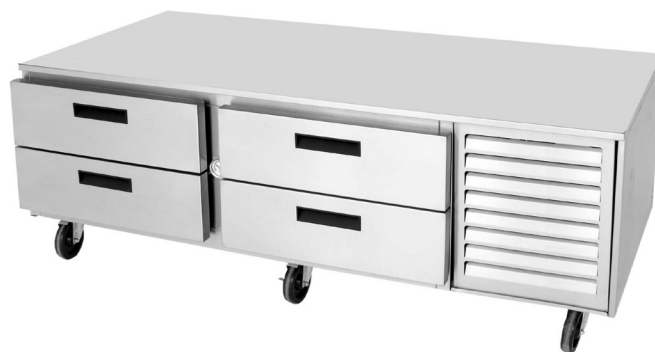
(Model 20064SB with optional casters)

20032SB (32" wide); 20036SB (36" wide); 20048SB (48" wide); 20060SB (60" wide); 20064SB (64" wide); 20072SB (72" wide); 20084SB (84" wide); 20096SB (96" wide); 20108SB (108" wide); 20120SB (120" wide)