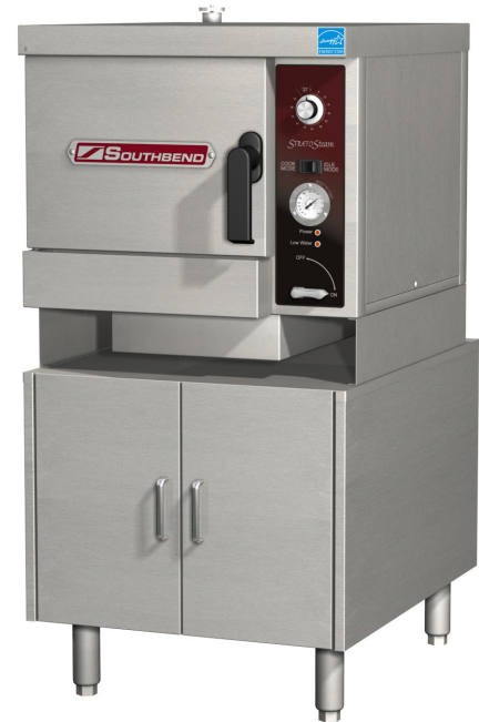
(STRE-3EZ shown on optional stainless steel cabinet)