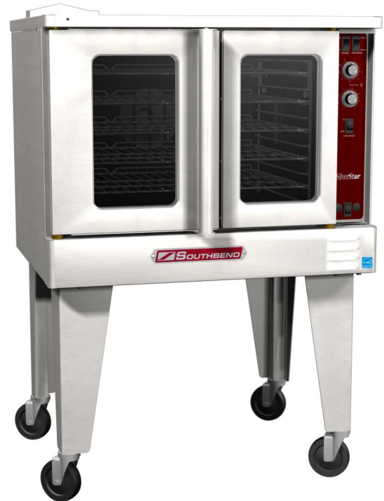
(SLGS/12SC shown with optional casters)

SLGS/12SC, SLGS/12CCH SLGB/12SC, SLGB/12CCH