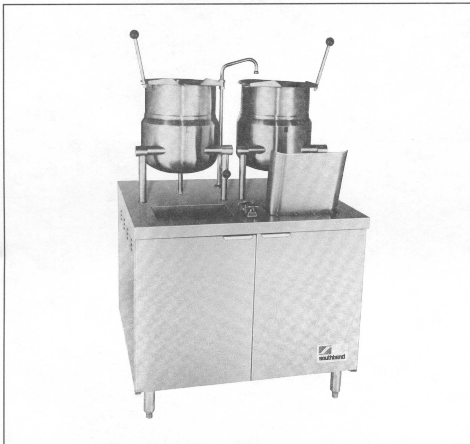
Model DMT-6-6 (36" Base)

MODELS: DMT-6-6 (Unit has 2 - 6 Gallon Kettles) DMT-6-10 (Unit has 1 - 6 Gallon and 1 - 10 Gallon Kettle)