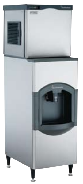
HD22 shown with a Prodigy CO322A cuber