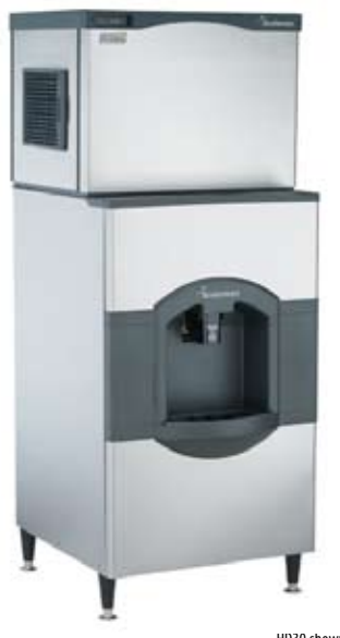
HD30 shown with a Prodigy CO330A cuber