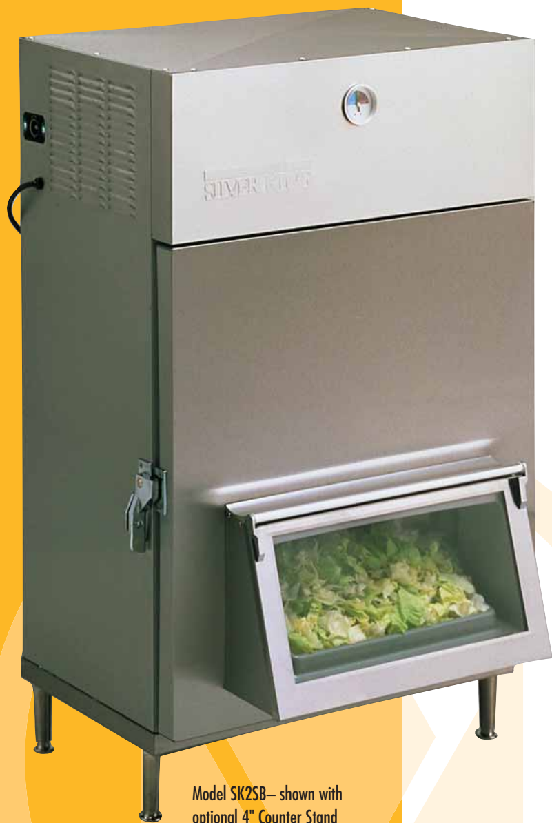
Model SK2SB— shown with optional 4" Counter Stand