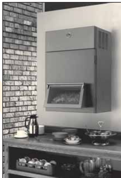
Wall mount kit included

SILVER KING WE'VE GOT REFRIGERATION DOWN COLD™