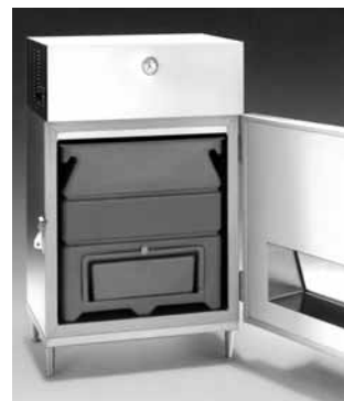
Removable bin holds 50 heads of lettuce. Additional bins available for auxiliary storage.

SILVER KING WE'VE GOT REFRIGERATION DOWN COLD.™