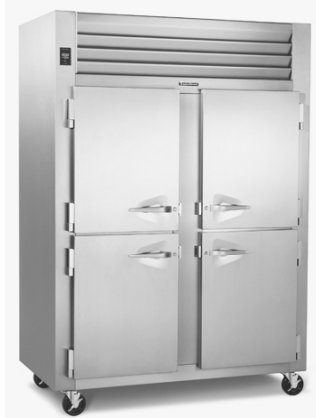
Model RHT232NPUT-HHS (shown with optional casters)