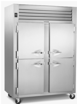
Model RHT232WUT-HHS (shown with optional casters)